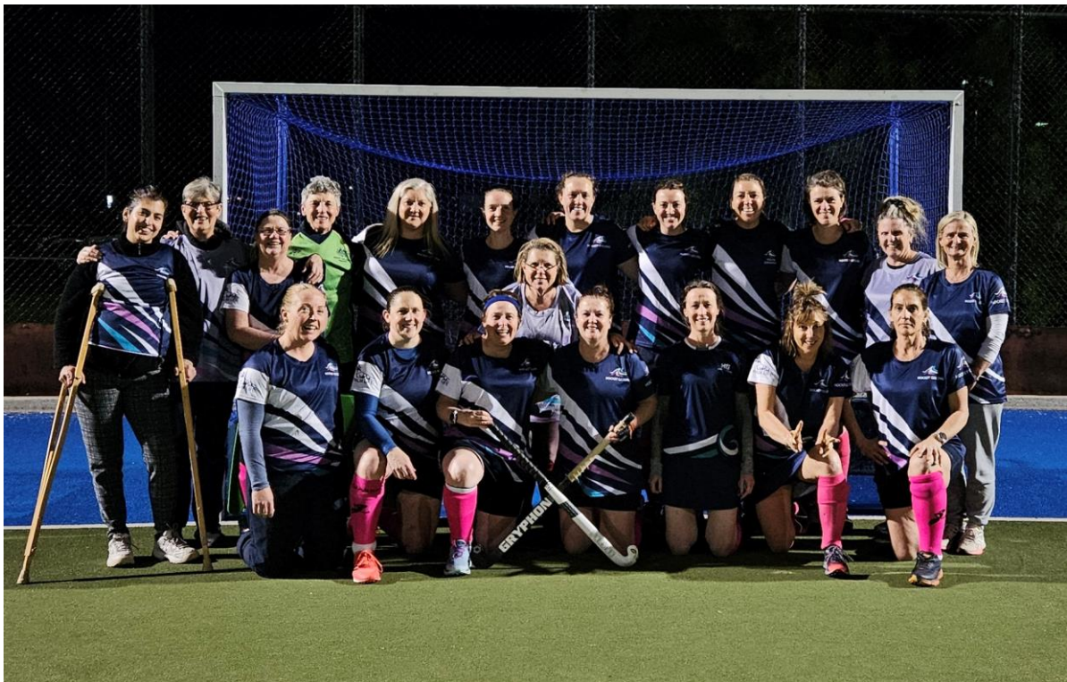
Team photo during the season