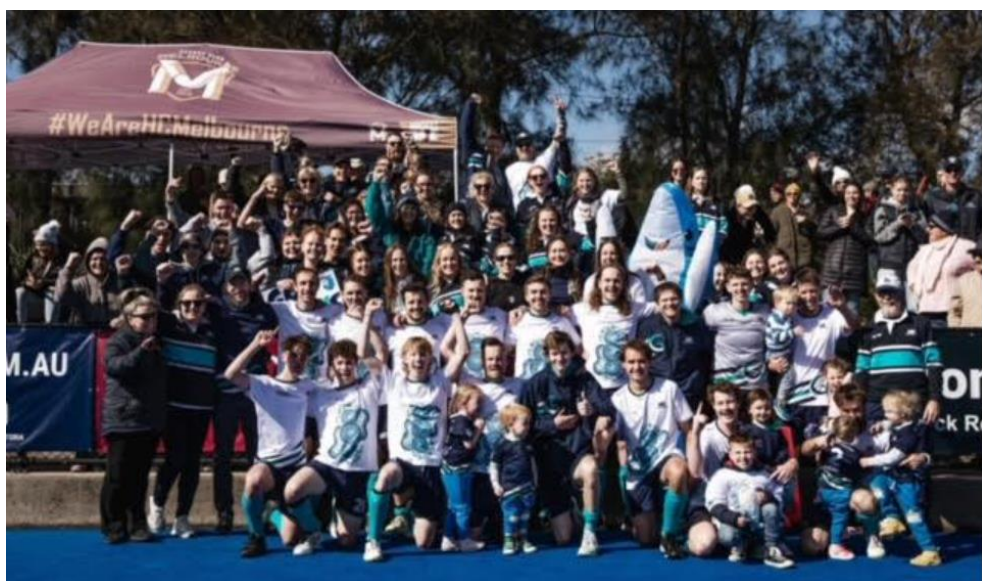
The Premiership team and the Sharks supporters