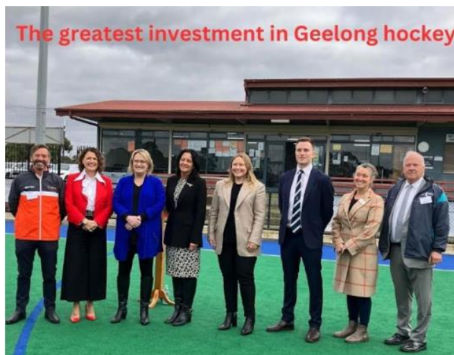
Announcement of funding for Stead Park Redevelopment