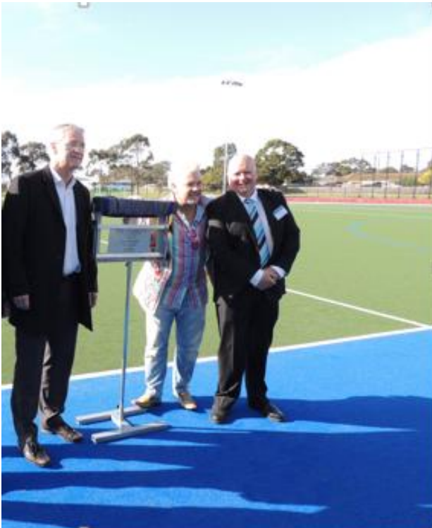
Left to Right The Honorable Damien Drum, Minister for Sport and Recreation, Victoria